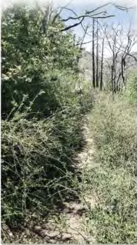
Before trail work started