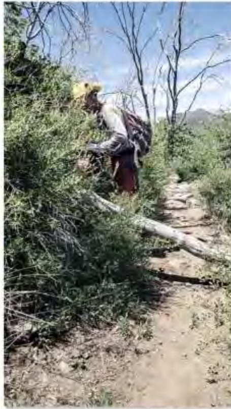
Clearing brush getting ready to saw some fallen trees.