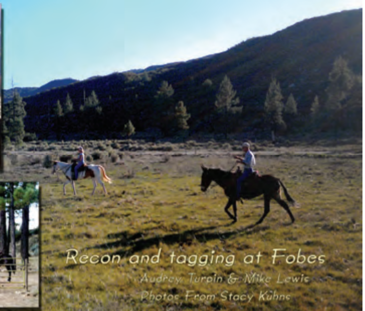
Recon and tagging at Fobes