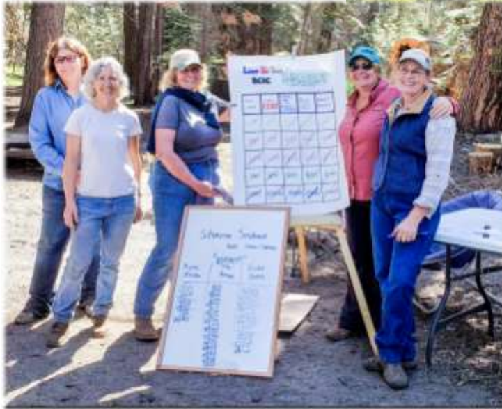
Winners of the first ever "Leave No Trace" Jeopardy Championship