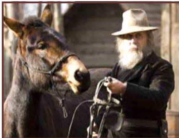
Amazing Grace & Robert Duvall